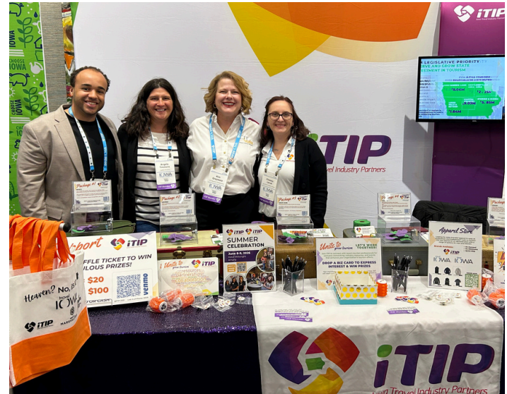
A Diverse Tourism Network